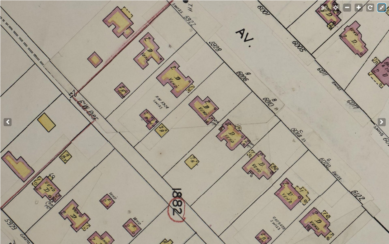
1950 Sanborn Map (Vol. 3)